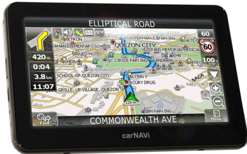
carNAVi S 510 retails for P8990

carNAVi builds GPS navigation solutions, that works straight out of the box. With the new S 510 carNAVi Corporation upgrades the ultimate S-series.