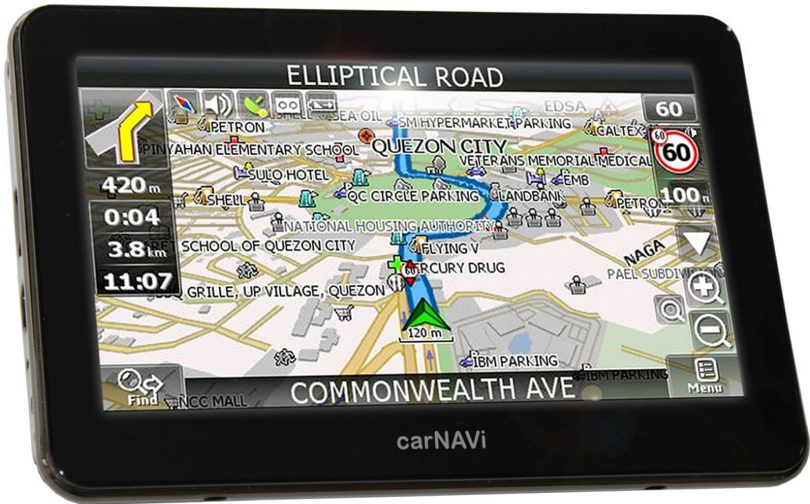
carNAVi S 510