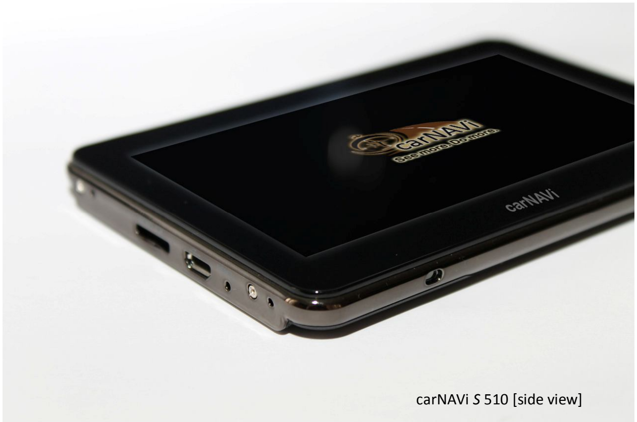
carNAVi S 510 [side view]